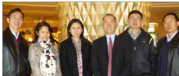
Small group of CPSA Shanghai 2011 Organizing Committee members at a symposium pre-meeting