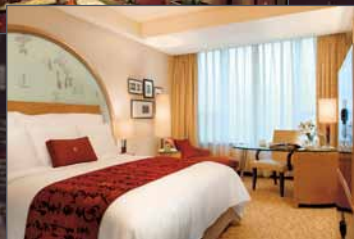
Renaissance Shanghai Pudong Hotel