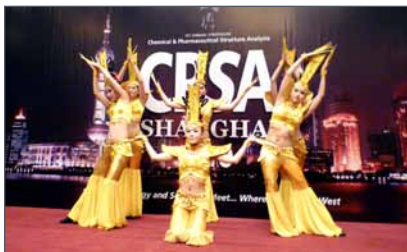
1st Annual CPSA Shanghai opening gala